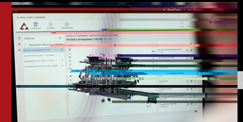
Smart Efficient spare parts identification