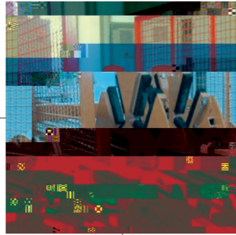
48 Star-shaped turning device